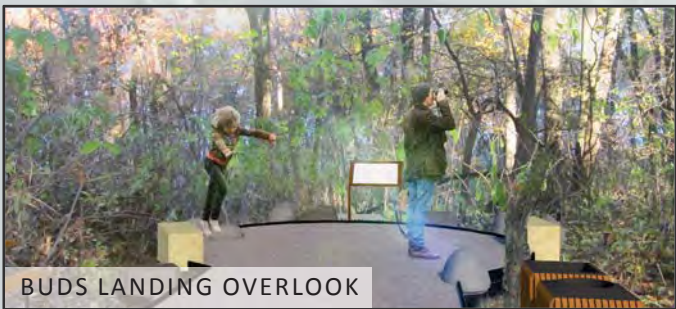
BUDS LANDING OVERLOOK

The Spring Lake Regional Trail is a four-mile segment of the Mississippi River Regional Trail (MRRT) network, a comprehensive trail system connecting the Minnesota cities of South St. Paul and Hastings. The MRRT also serves as part of the national Great River Road's Mississippi River Trail, travelling as far south as the Gulf of Mexico.