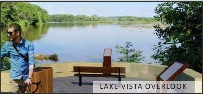
LAKE VISTA OVERLOOK