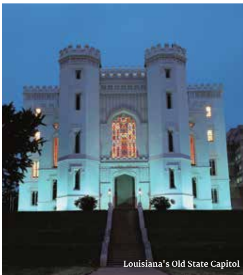
Louisiana's Old State Capitol