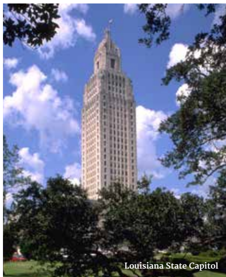
Louisiana State Capitol

Make plans to attend the Semi-Annual Meeting—register today!