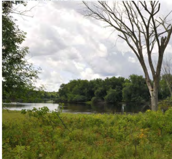
Crow Wing State Park is one of 12 state parks along the Great River Road.

Written By: Brainerd Dispatch | Sep 7th 2019 - 5am.