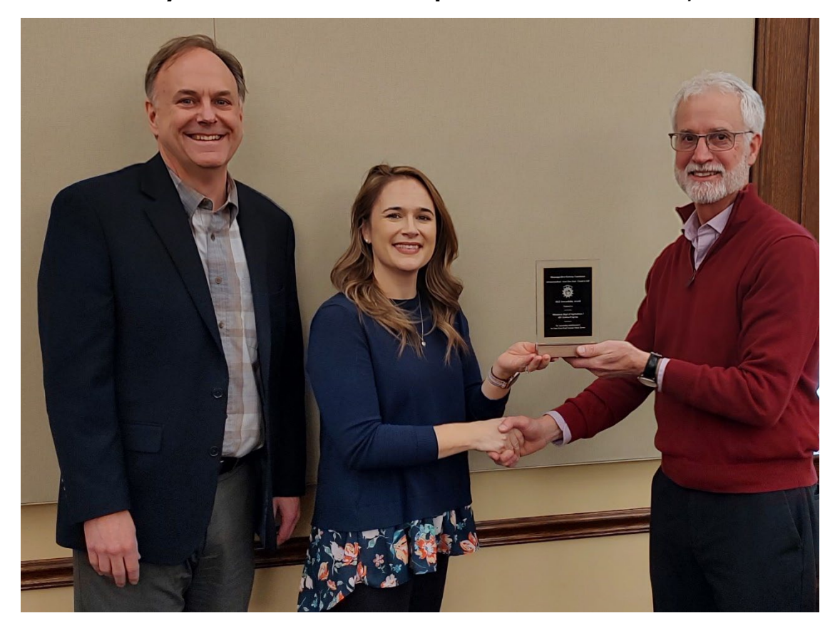
Mississippi River Operation Pollination Partnership Signing Event - April 19, 2024

Minnesota Grown/Minnesota Department of Agriculture Receives National Mississippi River Parkway Commission Stewardship Award – November 16, 2023