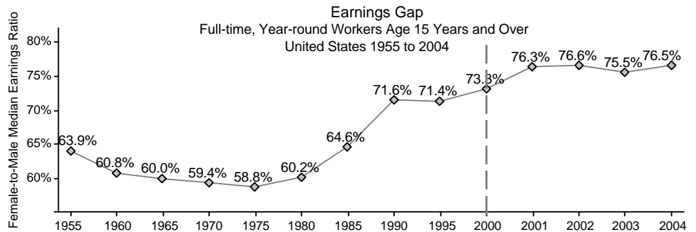
The chart above shows the earnings gap in five-year increments from 1955 to 2000 and includes yearly information from 2000 to 2004.